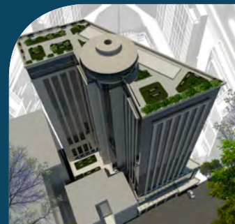
FOUR POINTS BY SHERATON ADDIS ABABA - ETHIOPIA