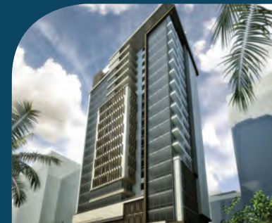
METRO RESIDENTIAL BUILDING ADDIS ABABA - ETHIOPIA