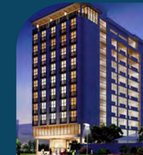
PULLMAN HOTEL ADDIS ABABA - ETHIOPIA