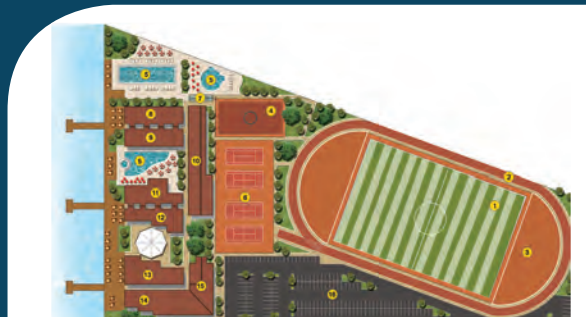
WADI DEGLA RUNDA CLUB NAIROBI - KENYA