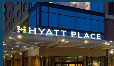
HYATT PLACE HOTEL ADDIS ABABA - ETHIOPIA