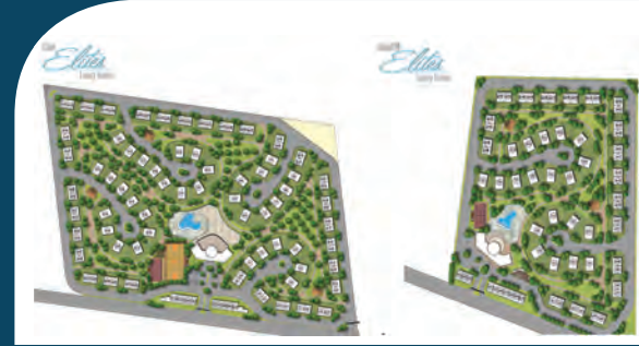
ELITES LILAYI & LEOPARD LUSAKA - ZAMBIA