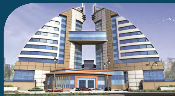
MINISTRY OF FOREIGN AFFAIRS N'DJAMENA - CHAD