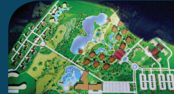
DUSIT THANI HOTEL ADDIS ABABA - ETHIOPIA