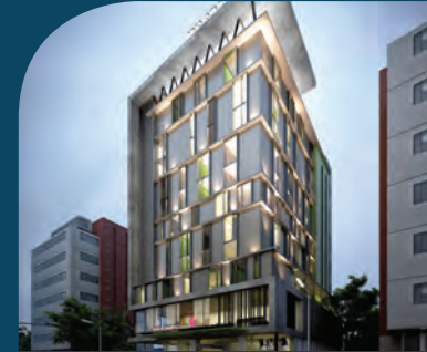
IBIS STYLES HOTEL ADDIS ABABA - ETHIOPIA