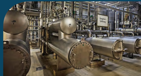
ETHIOPIA MOJO PLANT MOJO - ETHIOPIA