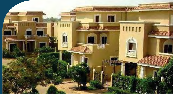
EL YASMINE RESIDENCE EL KHARTOUM - SUDAN