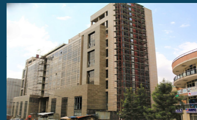
M GALLERY HOTEL ADDIS ABABA - ETHIOPIA