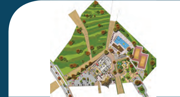
WADI DEGLA MIGAA GOLF CLUB KIAMBU - KENYA