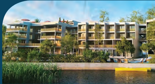
BAHIR DAR HOTEL BAHIR DAR - ETHIOPIA