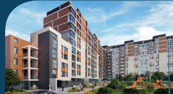
METRO COMPLEX ADDIS ABABA - ETHIOPIA