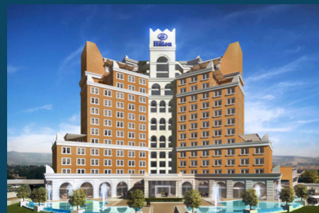
HILTON HOTEL MEKELLE - ETHIOPIA